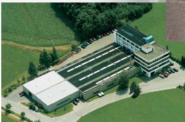
SMW-AUTOBLOK Caprie (Turin) - Italien