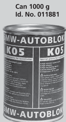
Can 1000 g Id. No. 011881