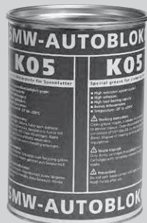
Can 1000 g Id. No. 011881