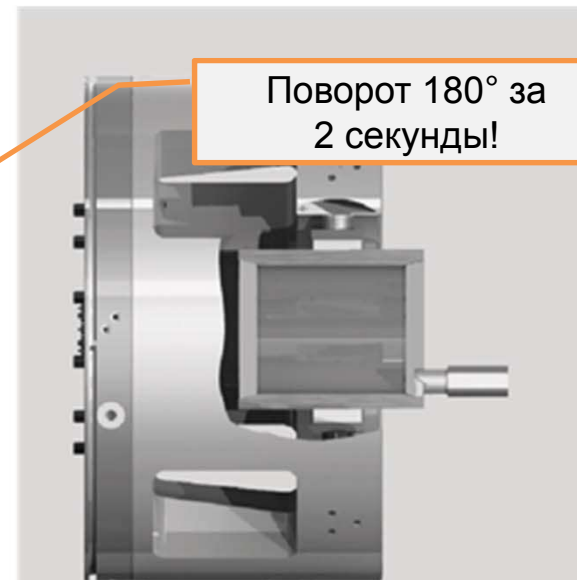
Fig. 3 After indexing 180° machining the thread on side 2.